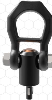
Threaded Lifting Pins